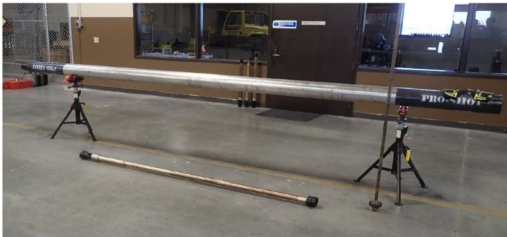
Figure 3: Exemplar Teledrift ProShot (on floor) and sub or drill collar (on stand)

As described by Dr. Jolson and as depicted above, the ProShot Measurement While Drilling (“ProShot MWD” or “ProShot”) tool, when fully assembled, includes a valve body, a paddle, a locking collar, a lithium battery, a piston, a centralizer, and a